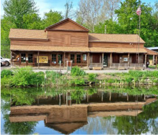
Sims Store Museum