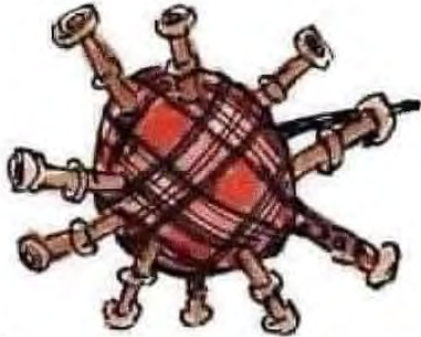
The SCOTTISH VARIANT. At least you can hear it coming.